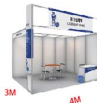
Image of Shell scheme booth